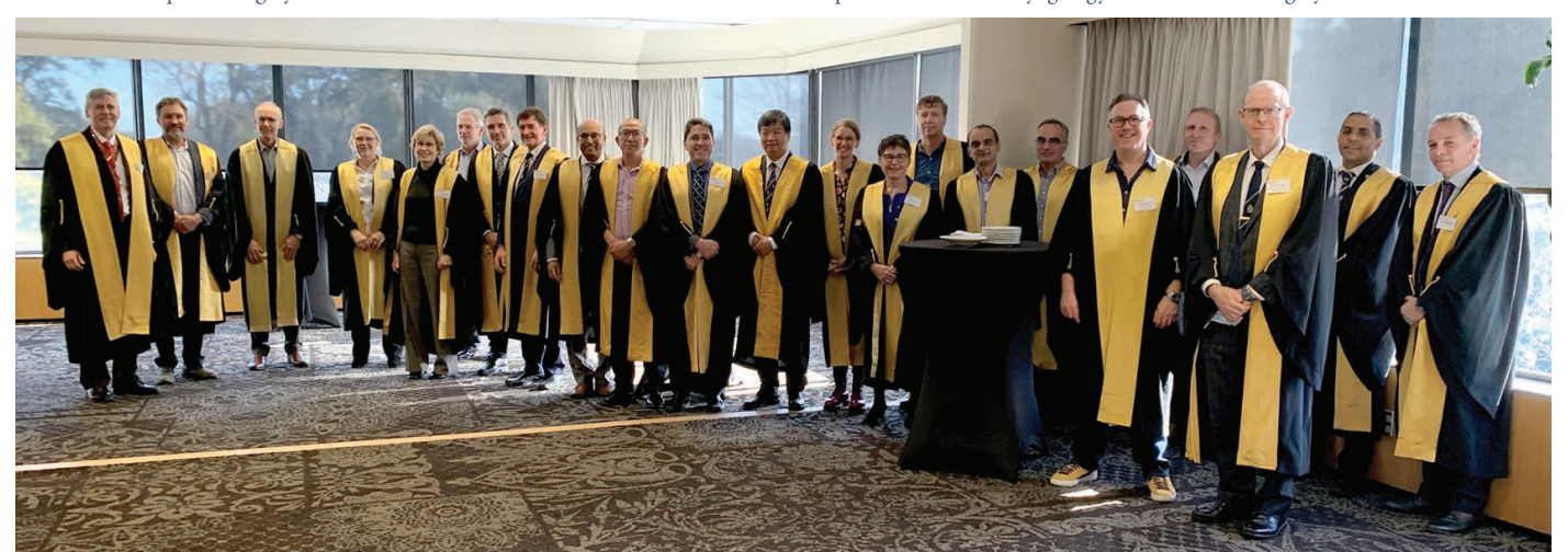
Examiners for the FEX in Christchurch.