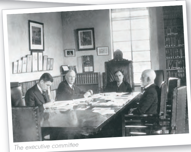
The executive committee