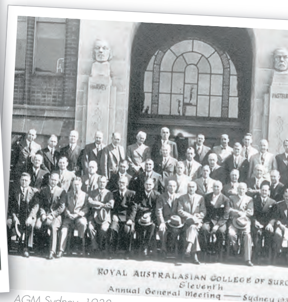
AGM Sydney, 1938