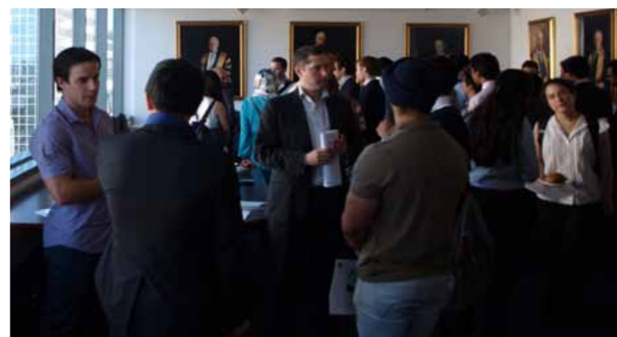
An 'in office' careers event in NSW; part of Surgeons' Month activities

The College audits continue to grow in strength. The Morbidity Audit and Logbook Tool (MALT) is now successfully being rolled out for the use by all Trainees and Fellows. Initially configured as a log book, the incorporation of the RACS Audit 'minimum data set' means that Fellows now can undertake a comprehensive audit of a section of their practice or, if they wish, record the details for all procedures. The Mortality Audit program continues with the production of highly useful reports; from the Annual Australian report to providing detailed feedback to an individual surgeon. A seminal paper was prepared by the Clinical Director of the Western Australian Mortality Audit, Mr James Aitken and published in the Medical Journal of Australia, demonstrating the benefit of the audit in reducing deaths in Western Australia amongst surgical patients over a ten year period.