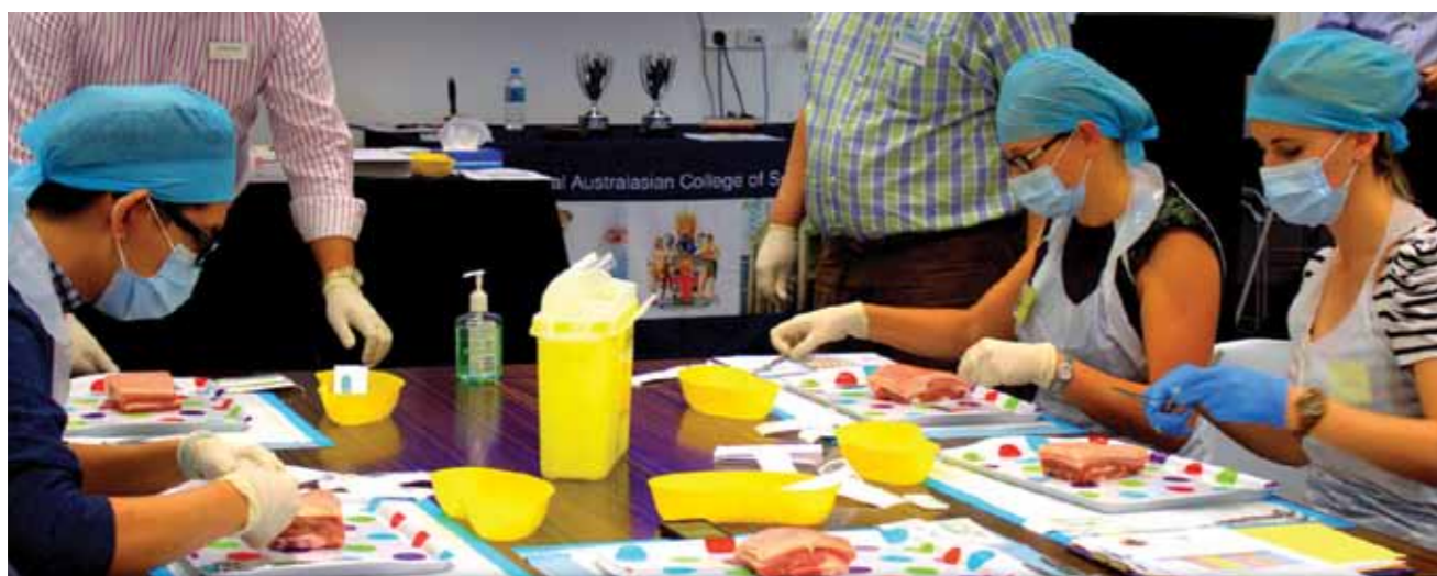
Participants in the Surgical Skills Competition in Queensland

Association. Thank you all for your hard work, for without that, many of our good ideas would have been only that. The College and the Fellowship is in your debt.