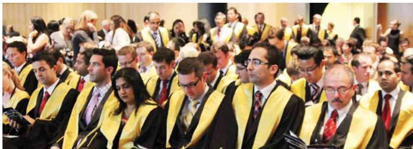
Convocation of new Fellows, 2013 Annual Scientific Congress, New Zealand

the nine specialties. There is significant concern about all nine specialties of the College breaking into smaller areas of expertise and the negative impact this would have on workforce availability.