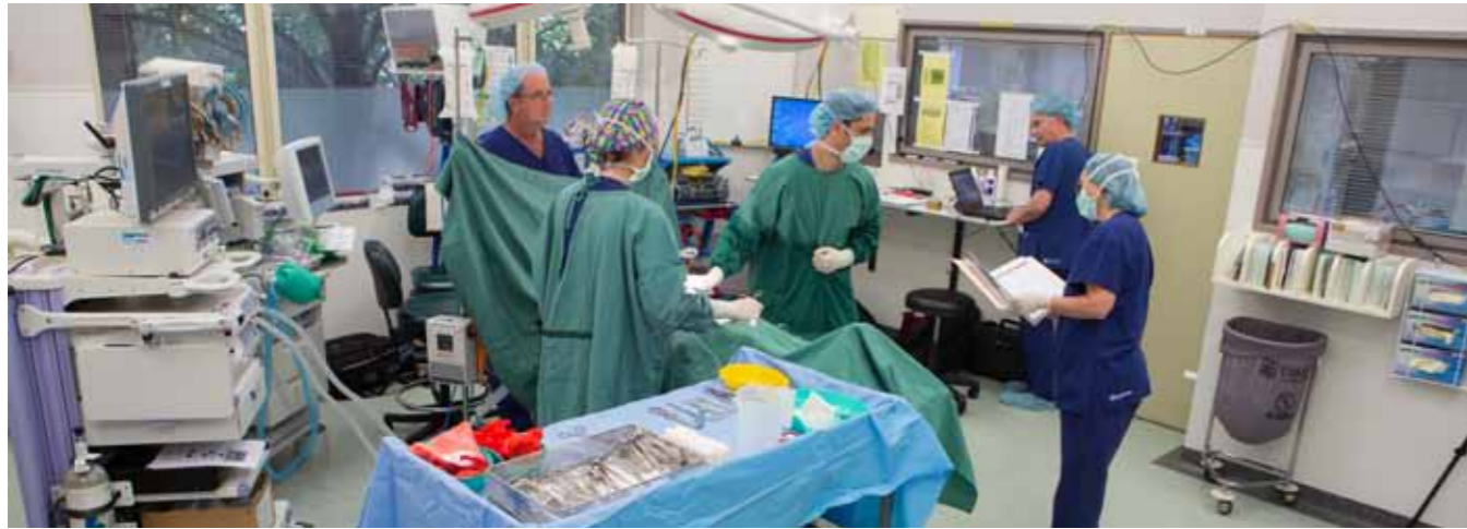
A simulation to support the work of the Research, Audit and Academic Research Division

anaesthesia when needed across the world. This involves taking our advocacy from Australia and New Zealand to work with the 193 countries that make up the World Health Organisation to try to have an agreed measure of surgical and anaesthetic safety. With that in place, it will then provide the impetus to have surgical infrastructure, resources and eventually training in all countries. The marker is the peri-operative mortality ratio that can be captured in most countries. This is a new level of College advocacy and there are many influential groups, including the Lancet Commission that includes Fellows of this College, Russell Gruen, Rowan Gillies and David Watters.