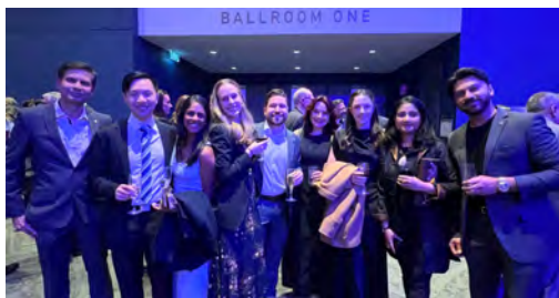
Delegates gathering for a night of celebration at the Congress dinner.