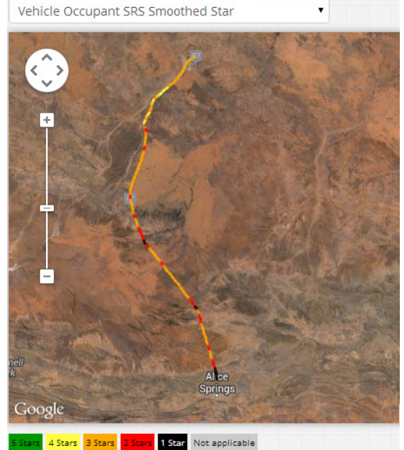
Barrow Creek - Alice Springs (130kph)