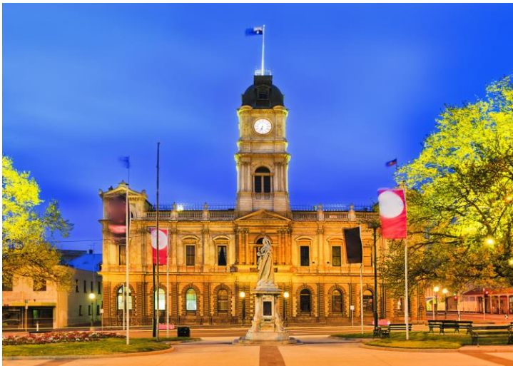
Image of Ballarat Town Hall, Victoria