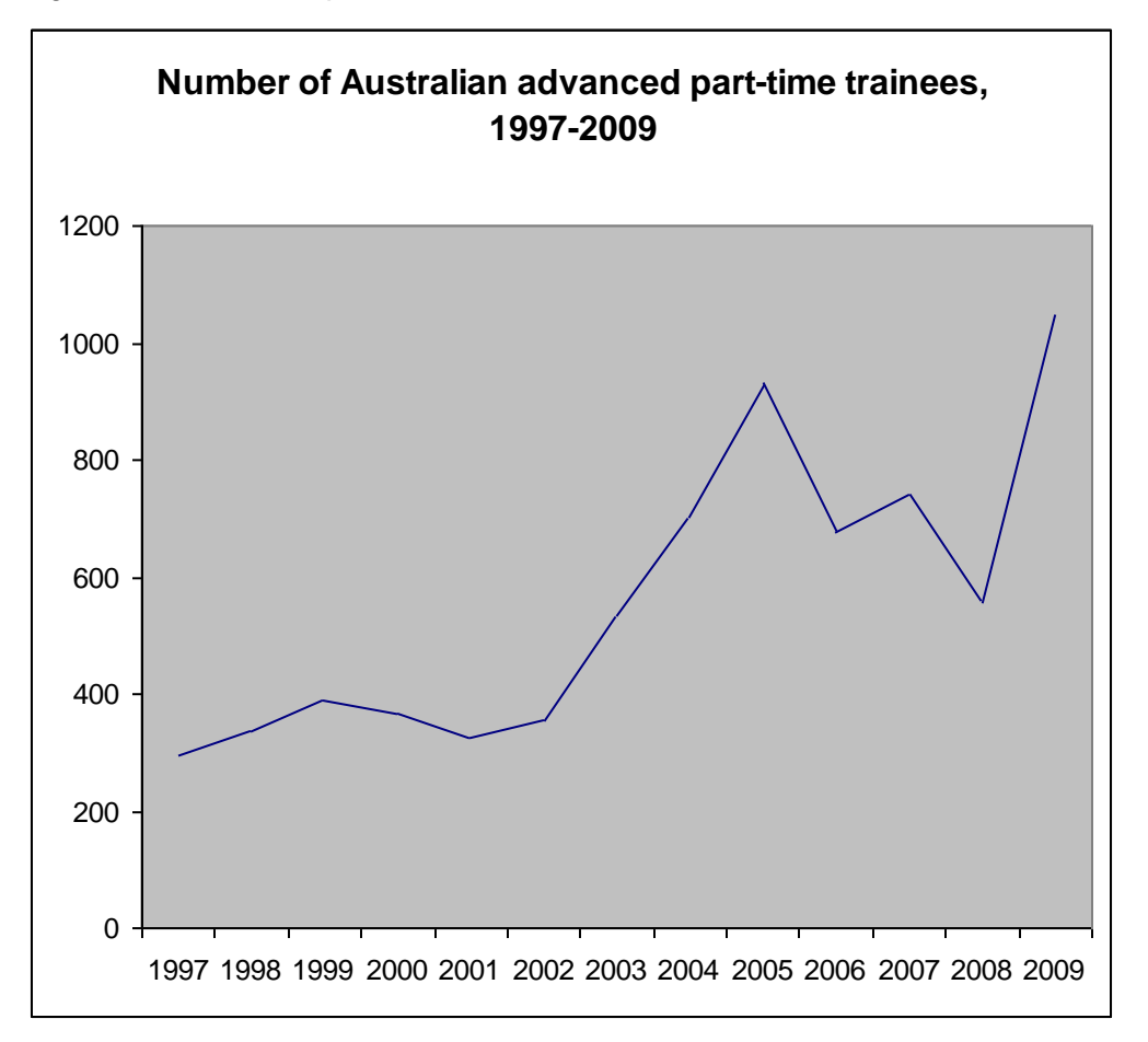
Figure 1 - Number of part-time advanced trainees, 1997–2009<sup>39</sup>