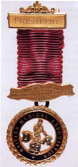
Barnett's presidential badge from the congress is one of the College treasures.