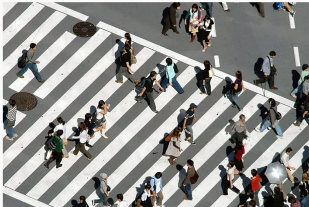
PHOTO: People walk over a pedestrian crossing in Tokyo, Japan. (Cougar Studio: Flickr)

There has been a rise in pedestrian deaths so far this year and at least one pro-walking group has pointed the finger squarely at motorists and road design.